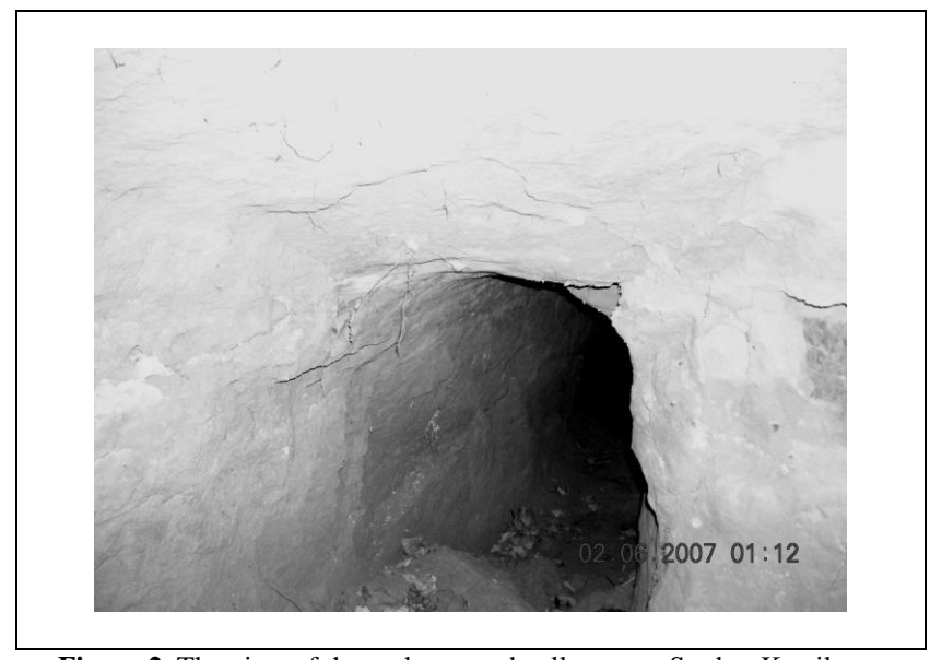
Figure 2. The view of the underground gallery near Sredne-Krasilovo.

The central entrance to the monastery was located on a steep slope. It was a grotto – a shallow cave with a vaulted ceiling and wide corridor. The vault was low due to collapsed clay deposits. As a result of the collapses, the deposits of clay blocked the passage. From the central entrance down the slope, there was a path to a shallow well – the Holy spring.