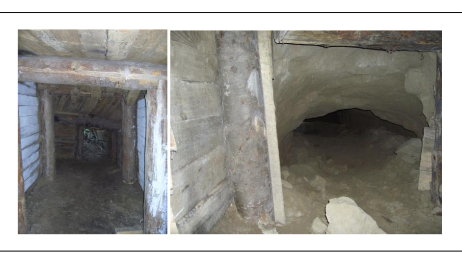
Figure 3 . The current state of the cave gallery near Sredne-Krasilovo.

Unfortunately, at the beginning of the 21<sup>st</sup> century, the integrity of the underground structures was compromised. The reason for this was the crumbling of the vents and compromised natural air circulation. The pre-entrance part of the cave is deteriorating as well. The deterioration of the vault depends on the density of the crumbling rock. Cracks form, as a rule, due to surface water penetration (Figure 3).